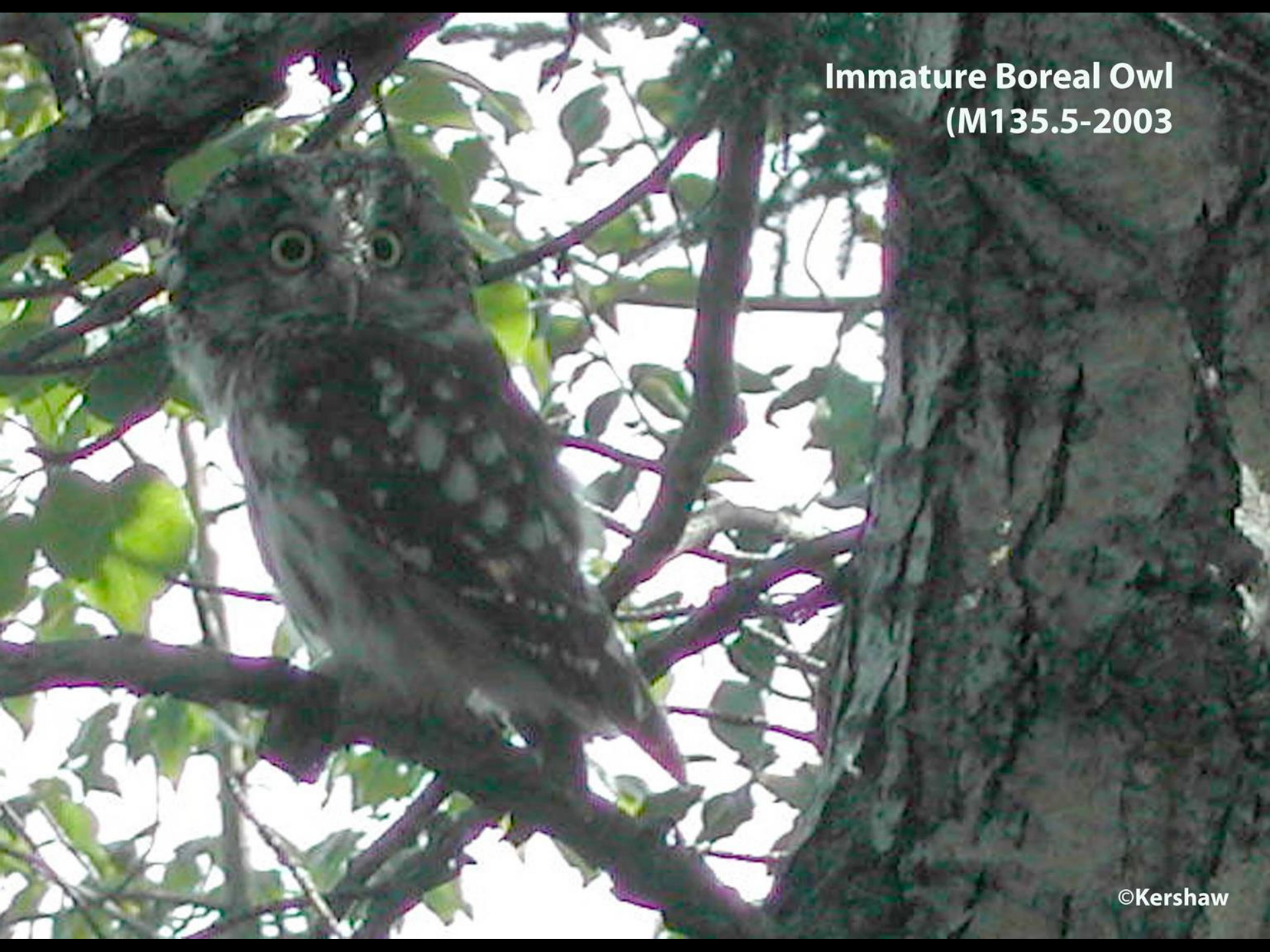
Immature Boreal Owl (M135.5-2003)