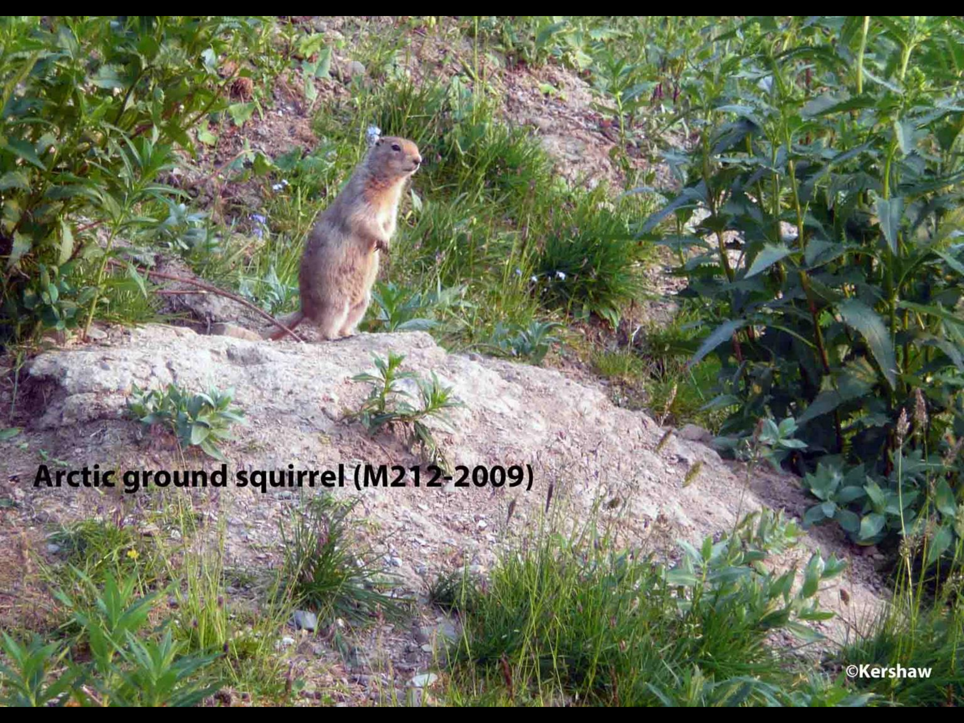
Arctic ground squirrel (M212-2009)